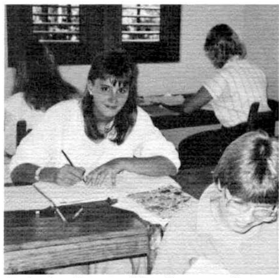
Academic achievement lifts self-esteem and creates hope for even greater success.