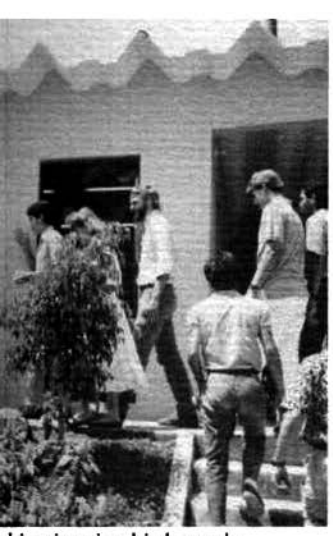
Nondenominational chapel services augment the moral and spiritual training provided through daily devotional sessions.

The student senate committee has assisted staff in developing a finely tuned points and levels system that determines most privileges such as dating, job choice, work pay, free time activities, etc.